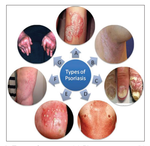
Figure 1: Types of psoriasis. (a) Plaque psoriasis, (b) inverse psoriasis, (c) nail psoriasis, (d) erythrodermic psoriasis, (e) pustular psoriasis, (f) guttate psoriasis, (g) psoriasis arthritis)

It is very rare type of psoriasis and affects only 3% of people with psoriasis. It can take two forms: First, progressive chronic plaque psoriasis which becomes extensive and confluent and second, erythroderma which can lead to impairment of the thermoregulatory capacity of the body which further causes hypothermia, widespread inflammation on the body surface