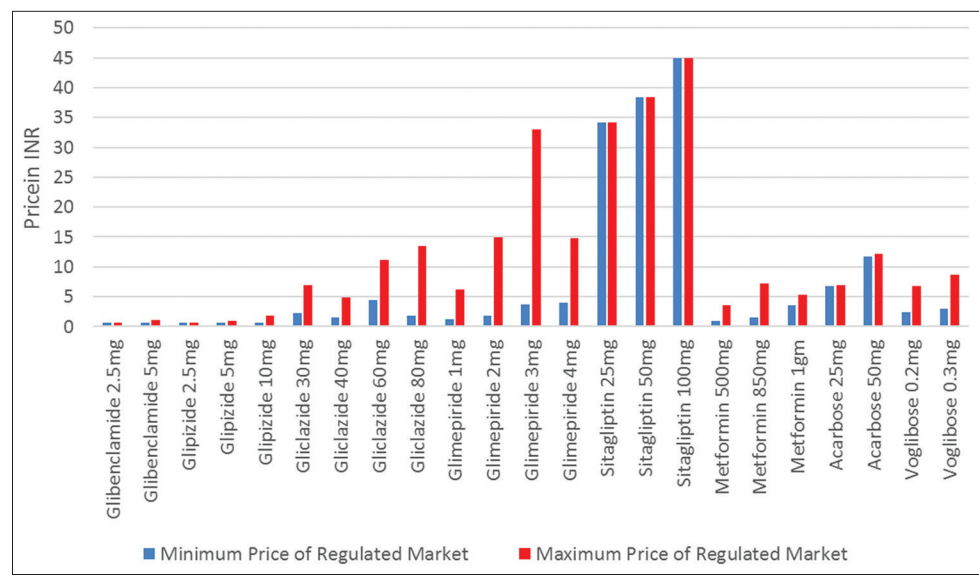
Figure 1: The cost variation of antidiabetic drugs available in different formulations in regulated market. It is clear from the graph that there is a huge variation of prices among regulated market also