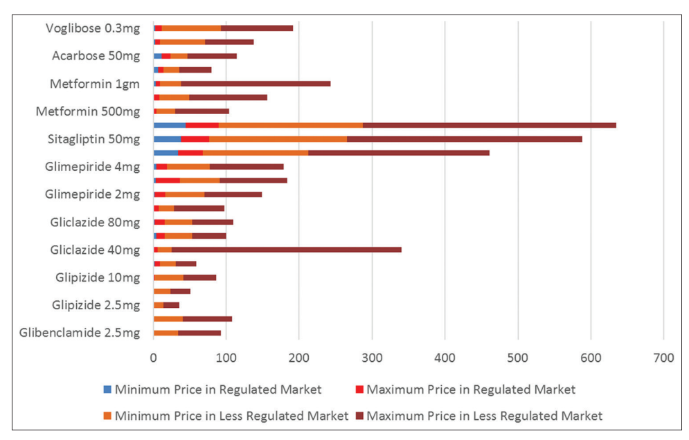
Figure 3: The price variation between regulated market and less regulated market. The blue color in the graph represents minimum price in regulated market; red represents maximum price in regulated market; green represents minimum price in less regulated market; and orange shows maximum price in less regulated market

existence lead to price variation of the drugs depending on their location. There are many formulations, prices of which are directly controlled by inventors (patented drugs) which leads to the fluctuations in the prices.<sup>[18]</sup>