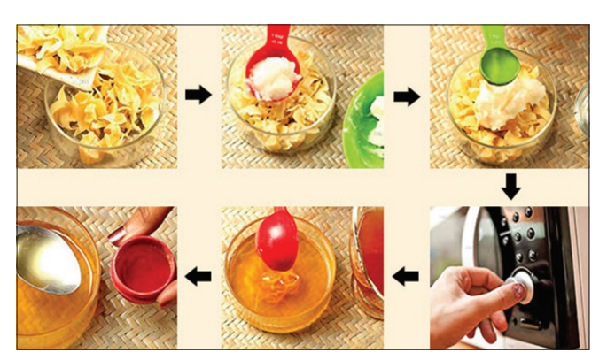
Figure 2: Steps involved in the preparation of lip balm

salve around 1 cm above the upper tip. Then, place the beaker in water bath and heated at a slow rate so that the temperature rises at 2°C/min up to 45°C and later temperature rises at 1°C/min rate. Finally, the salve starts to lose its shape and bends recorded as a softening point.