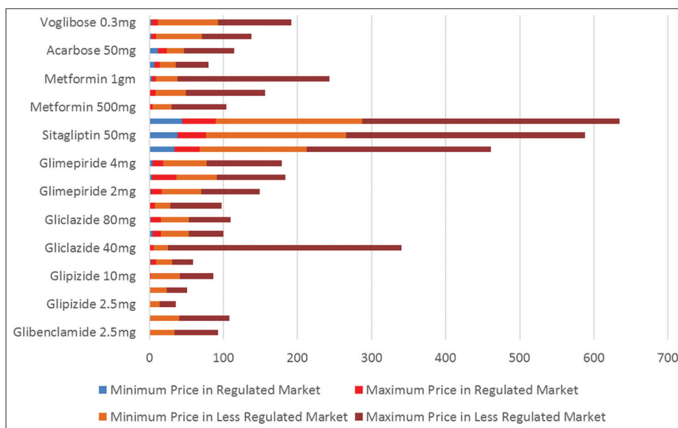
Figure 3: The price variation between regulated market and less regulated market. The blue color in the graph represents minimum price in regulated market; red represents maximum price in regulated market; green represents minimum price in less regulated market; and orange shows maximum price in less regulated market

existence lead to price variation of the drugs depending on their location. There are many formulations, prices of which are directly controlled by inventors (patented drugs) which leads to the fluctuations in the prices. [18]